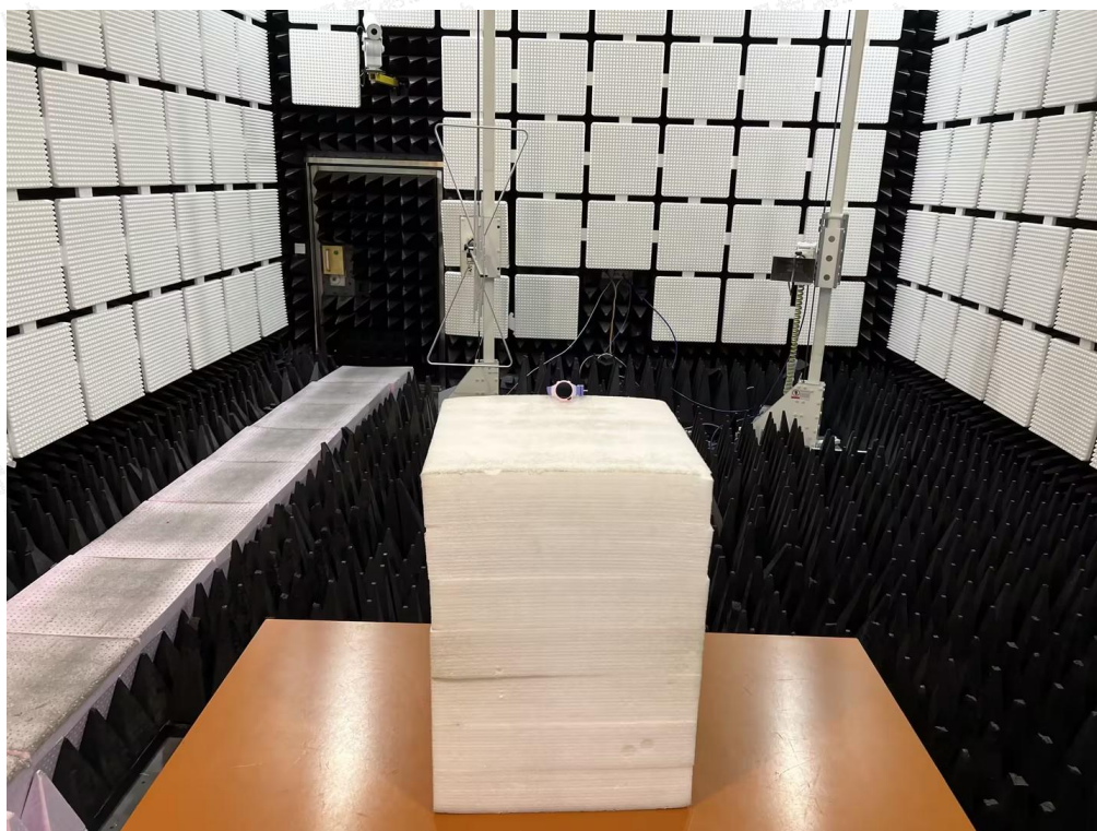
Spurious Emission below 1GHz & above 1GHz